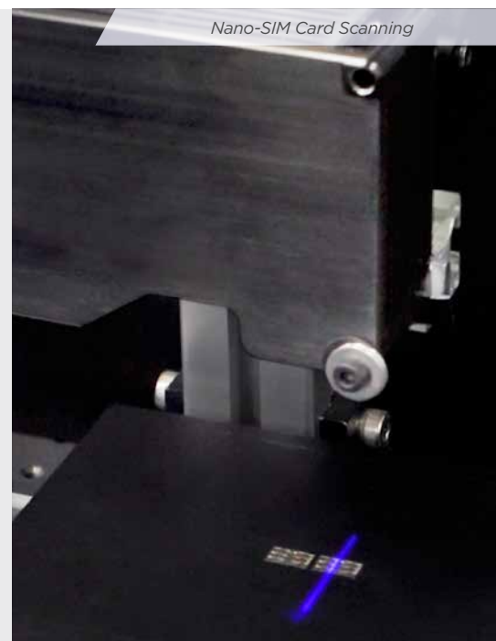
Nano-SIM Card Scanning

Because Gocator has a large measurement range, it is possible and required to "window down" the range appropriate to measure part height. Gocator 2420 can achieve scan speeds up to 5 kHz for parts that only need \frac{1}{4} of the overall measurement range. This means a single nano-SIM connector surface can be fully inspected to meet process cycle time.